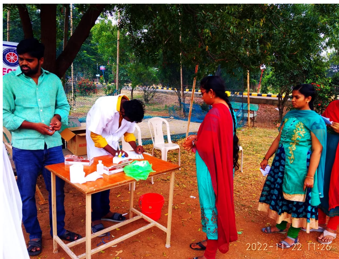
First year students of TEC participating in Blood Grouping Camp